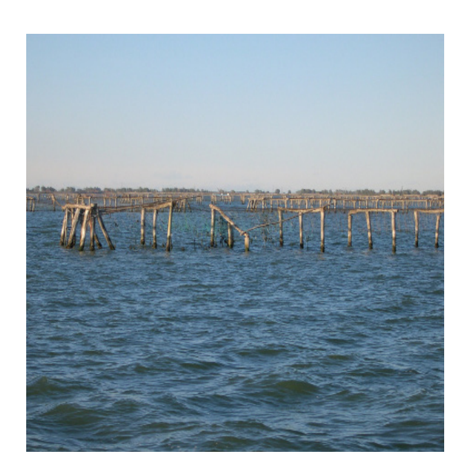
Restrictions derived from ecological and environmental protection needs

Where there are facilities for the breeding of shellfish it is strictly forbidden to transit, navigate, anchor, fish, swim and dive for unauthorized persons and vehicles ( ). Furthermore, it is forbidden navigated at a distance of 500m from mussels farm ( ).