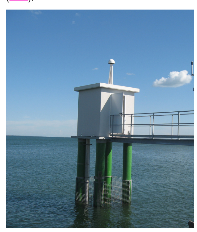
In Map 3 are also included monitoring stations of the water column , with particular reference to oceanographic buoys, tide gauges and meteorological stations offshore the regional coast.

Nursery Area. By nursery area we mean a growth area of the juvenile forms of various species of marine organisms in their first year of life; the current Italian laws establish that areas within 3 nautical miles from the coast ( ) are classified as a nursery. Within these areas fishing is regulated in order to allow the renewal of fish stocks. In Sacca di Goro lagoon have been instituted 8 areas of nursery, to support the growth of the juvenile forms of mussels ( ).