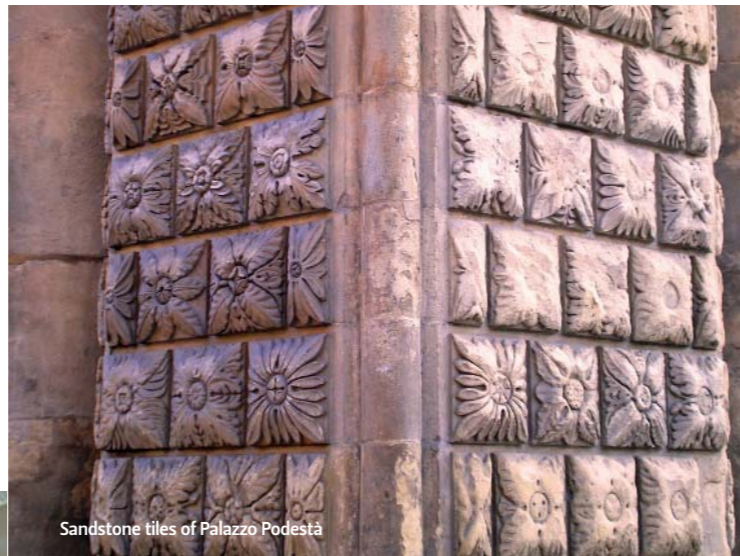
Sandstone tiles of Palazzo Podestà

Clay, sandstone and selenite are local rocks, that is why they are so common in the buildings and monuments of the old town centre. Sandstone is a kind of cemented sand whose grains mainly consist of quartz. In Bologna there are at least two different types of sandstone: a yellowish type, not very cemented and not very resistant (with clear signs of degradation) and another type, also known as pietra serena , that is harder and in a grey-blue colour. Clay, in the form of bricks and terracotta, is the main material of the city palaces and monuments, its colour ranges from red to yellow. Bologna had very few stones, so terracotta has been widely employed since the Etruscan age, for this reason Bologna is called the red city. In the façade of Palazzo Comunale sandstone is the protagonist of the portal and clay is the material shaped by