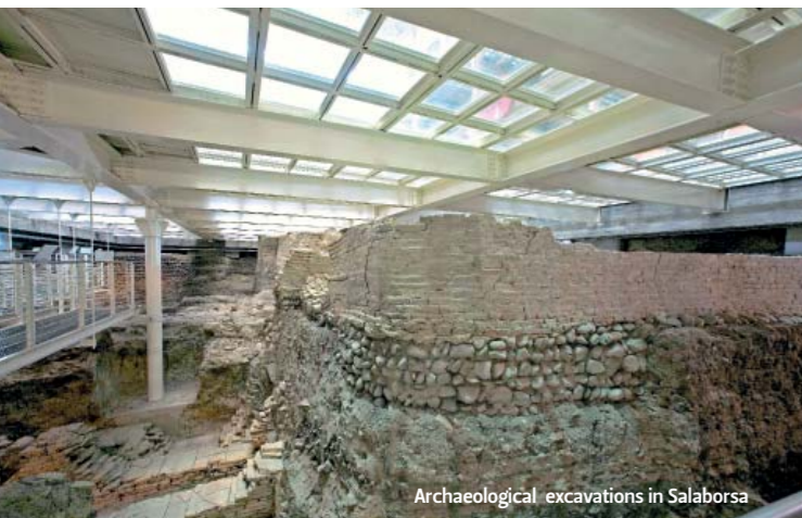
Archaeological excavations in Salaborsa

A crystal floor shows the archaeological excavations, which in 1989–90 revealed the existence of a building that was probably the seat of administrative offices of the Roman colony Bononia (II–I century B.C.). According to geological studies the subsoil of Bologna is characterized by the presence of gravel, sand, silt and clay that were deposited by the Apennine rivers. Clay and silt are in the old town centre, whereas gravel and sand are mainly to be found in the outskirts of the town, due to deposits from the Reno river and the Savena stream. This distribution of sediments in the subsoil shows that the Reno river and the Savena stream have often come close to the old town centre but have never gone through it. It was in this area, which was better protected from floods, that the Roman colony of Bononia was founded.