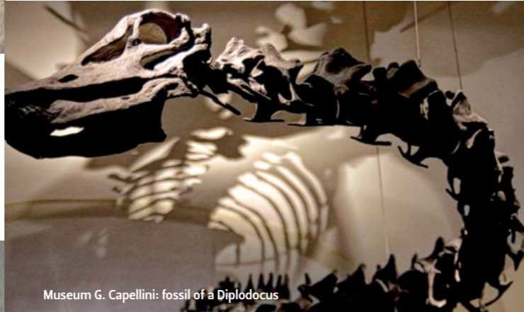
Museum G. Capellini: fossil of a Diplodocus

Here are two important museums of the nineteenth century, inaugurated in the golden period of geology in Bologna. The Geological Museum G. Capellini was set up in 1860, when Giovanni Capellini was called by the University of Bologna to hold the first chair of Geology in Italy. The museum shows finds from the regional and national territory and rich collections of rocks, plants, invertebrates and fossil vertebrates, among which the skeleton of a diplodocus, 26 metres in length and 4 metres in height, donated by Vittorio Emanuele III and found in 1899 in Wyoming. The Museum of Mineralogy and Petrography Luigi Bombicci was founded in 1861 when Bombicci was entrusted with the first chair of Mineralogy of the University of Bologna. About ten thousand pieces are exhibited in the museum, about one fifth of the total heritage of the collections, and are divided into sections. A very interesting section is the section on the Bologna phosphorus stone, a worldwide known variety of barite that is found in the badlands of Paderno. It was discovered between 1602 and 1604 and represents the first observation of the phenomenon of phosphorescence. University Museum System Alma Mater Studiorum University of Bologna http://www.sma.unibo.it