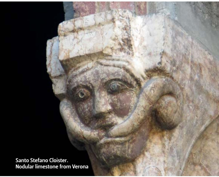
Santo Stefano Cloister. Nodular limestone from Verona

and nodular limestone from Verona. Istrian limestone, extracted since the Roman period, is widespread throughout the city, where it arrived from the quarries of Croatia, going through Trieste, Venice, Ravenna and reaching Bologna by river.