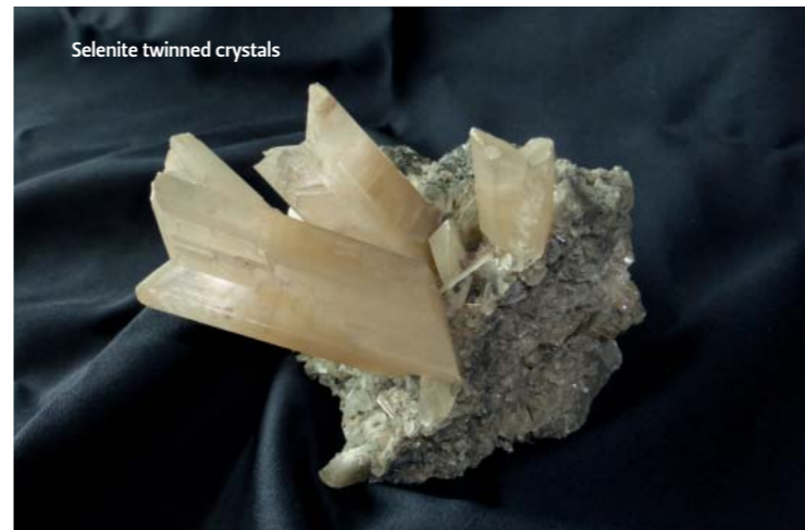
Selenite twinned crystals

Here we are, at the feet of the monument that is the symbol of Bologna: the two towers. The Asinelli Tower, the taller one (97.20 m) and the Garisenda Tower, the smaller one (47 m) that is clearly leaning. The basis of the Garisenda Tower is covered with selenite, with the characteristic dovetailed twinned crystals with a milky shine that resembles the reflection of the moon ( selene in Greek). Selenite is a rock consisting of gypsum, originating from evaporated sea water. In the Messinian (about 6 million years ago) the Strait of Gibraltar closed, isolating the Mediterranean from the Atlantic Ocean. In these conditions selenite sedimented in the low seabed of the sea basins along the edges of the Apennines. The wide diffusion of selenite in Bologna is due to the proximity of gypsum extraction areas and to its humidity insulation properties. Selenite is the material that was used for the first circle of walls of the city (IV–VI century) and for most of the foundations of the buildings. The characteristic leaning position of the towers is due to the subsoil. The soil under the towers is made up of silt and clay with different consolidation levels. Over time the static load of the towers has caused a non-homogeneous sinking of the soil and of the foundations, which in the past 100 years has increased by 0.3–0.4–mm/year.