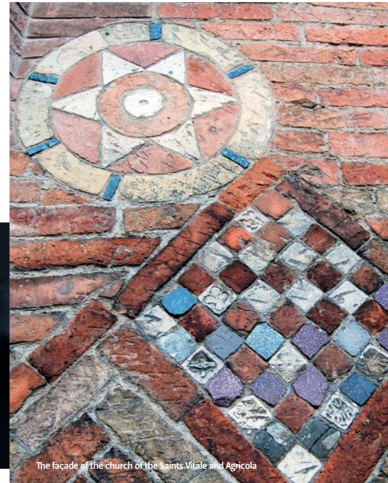
The façade of the church of the Saints Vitale and Agricola

in terracotta. Inside the church, among other attractions, there are two marble sarcophagi that support a Greek marble slab, coming from a Roman monument. In the Basilica of the Holy Sepulchre, seven African marble columns surround the sepulchre of Saint Petronius. African marbles, like Apuan and Greek marbles, came to Bologna only during the Roman imperial period, then they were no longer used. They started to be used again from 1850 onwards, with the introduction of railroad transport.