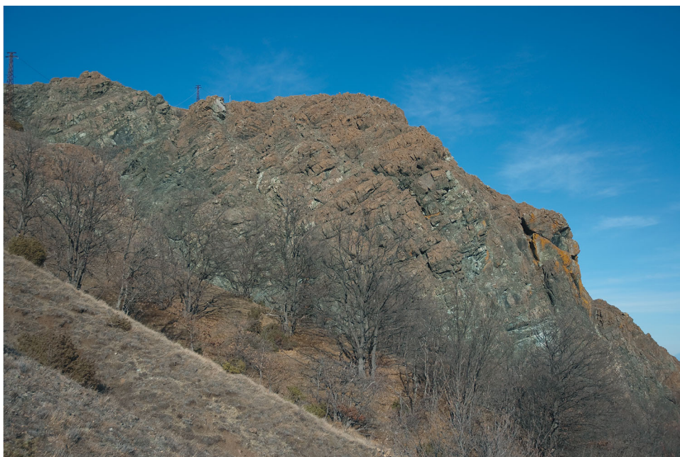
Figure 2. Massive peridotites outcrop and correspond to Mt. Prinzera's eastern slope. The picture clearly shows the pervasive planar foliation of the rock mainly due to tectonic deformation.

Aligned landforms can be recognized in the area too. In some circumstances, the alignment of ridges and trenches is noteworthy, such as with M. Prinzerotto . In other cases, ridges and trenches may be aligned with gaps, as visible to the south of Case Prinzera or north-east of Boschi di Bardone . In these instances, the gaps are aligned but arranged orthogonally to the other forms as they are related to faults that cut the ridges. Moreover, gullies are also developed along the same alignments of forms, highlighting the existence