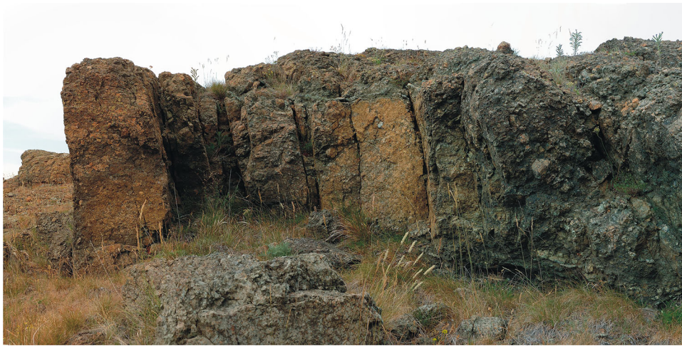
Figure 5. The discontinuities are often pervasive and open, thus the rocks appear completely detensioned, as in the outcrop of peridotites shown (see photograph number 3 on the geomorphological map).

Their shape could indicate that their development was caused by erosive processes which removed surface material from an extensive area rather than by the action of erosion acting in a well-defined direction (i. e. rill and gully erosion). This might support the hypothesis that the genesis of these surfaces was driven by planar structural or tectonic features.