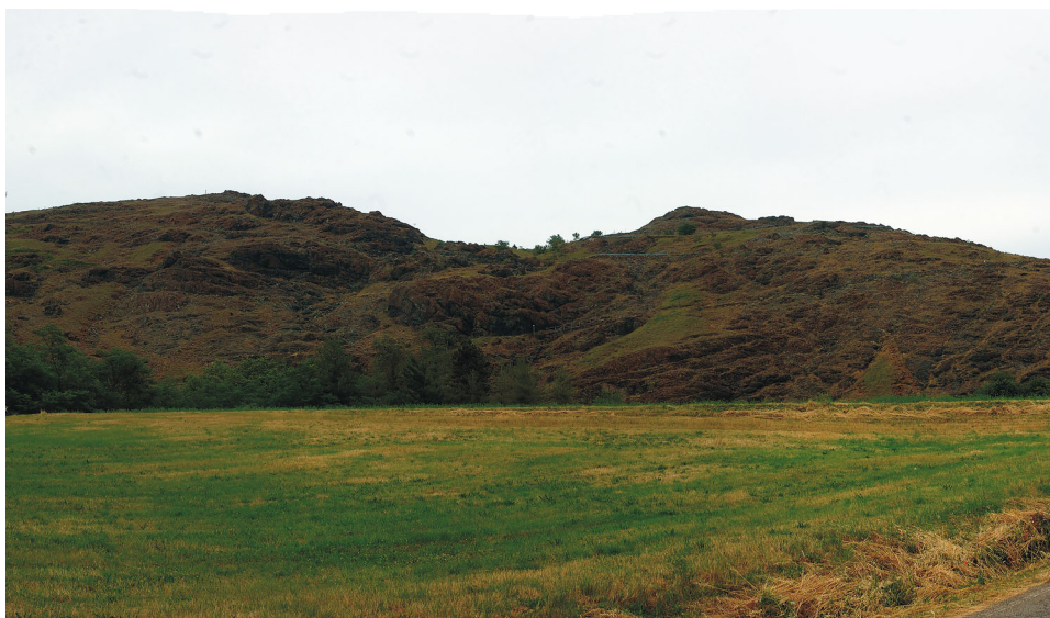
Figure 4. The gap shown in the picture, corresponding with Mt. Prinzerà's southern sector, is one of the better developed in the study area. These landforms are often aligned with linear forms, such as gullies and rills.

of control exerted on the erosion of running water. The development of parallel gullies and rills on Mt. Prinzerà's western side is worth noting as it is emphasized by the presence of scarps parallel to the previous features.