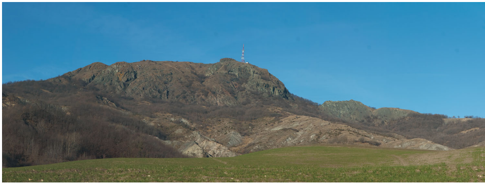
Figure 1. The landscape view of Mt. Prinzerà's eastern side. The ophiolitic rock complex rises from the surrounding gentler slopes made up of soft rocks (clay-rich breccias and flysch). The rock mass is divided into several portions (in the middle/left-hand side of the photograph the principal one and on the right-hand side the secondary blocks) because of the presence of E-W fault system.

and peridotites breccias, with a maximum thickness of about 250 m. Selective erosion has removed the surrounding pelitic soft rocks leaving the ultramafic olistolith emergent in the landscape (Figure 1).