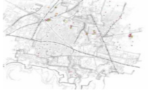
Parco Agricolo Periurbano Periurban Agricultural Park

The chosen strategy is to operate in order to build up in time a vast green infrastructure, an arboreal-shrubby vegetation area with features of continuity together with a pedestrian and bike network that goes through the piedmont flatland, placing itself inbetween the biggest urban systems and the strip of hills; a green corridor between the rivers Secchia e Panaro, a piedmont green line that also allows relations between the inhabitated centres on the via Emilia and the hill stripe.