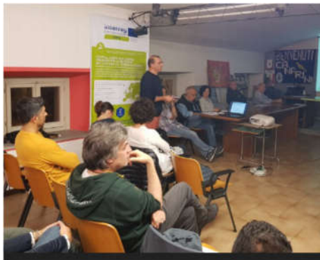
Lago Santo Modenese (13 participants).

The methodology used to manage the meetings, following the CBW produced for CEETO project (DT2.2.1), had been inspired by the European Awareness Scenario Workshop (EASW), an approach that allows an open discussion in order to identify solutions that are concrete and easy to implement.