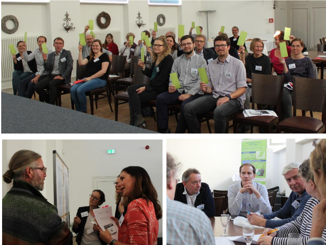
Pic 4. Impressions of the fourth workshop