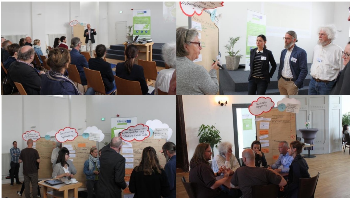
Pic 3. Impressions of the third workshop