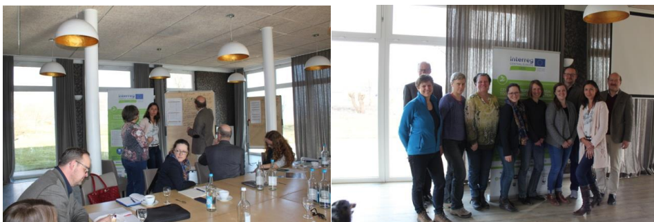
Pic. 1: Impressions of the first workshop

In the workshop, the participant reflected on the past seven years of the Charter process and the implementation of the previous actions plan.